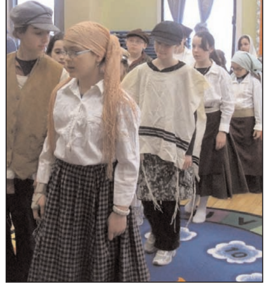
Cast rehearses for "Fiddler on the Roof."

That bat mitzvah took place last Saturday. The show took place the next day, before a large audience at Gann Academy in Waltham.